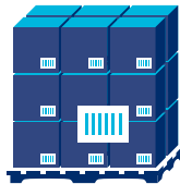
GS1-128 "Concatenated" data